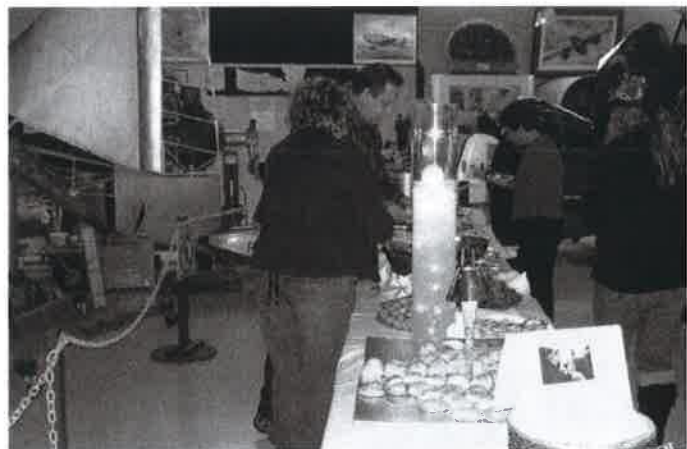
Guests landing at the "Heavenly Dessert Bar."

Get ready to sparkle April 10th -- see you at the Diamonds and Rivets Gala!