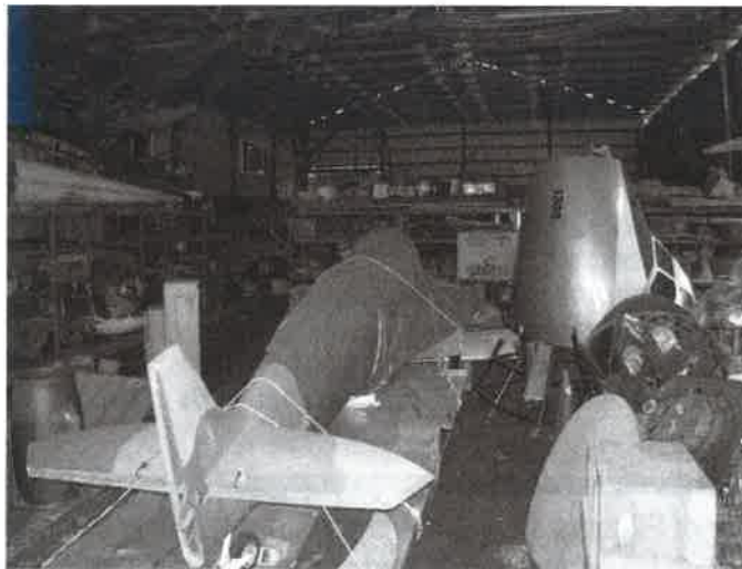
This view of the Barn gives some idea of the diversity and scale of the artifacts held by the Museum, including Spitfire replica, DC-9 cockpit section, miscellaneous engines, and rows of shelving holding smaller items.