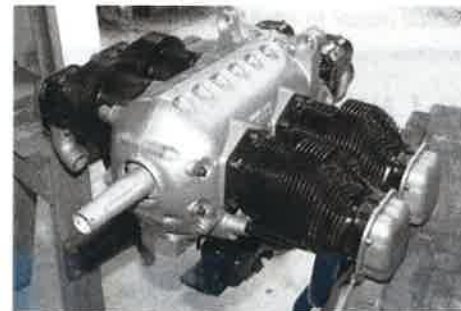
Continental A-65 ready for display, an excellent example of Vic Bentley's restoration work.

Led by Vic Bentley, volunteers have been making exceptional progress on engine displays. Our newly acquired Merlin (a Packard-built Merlin 224 version with a two-stage, single speed supercharger as fitted to the Canadian-manufactured Lancaster X) is now on display in the main hangar thanks to a wheeled stand designed and fabricated by Dave Beales. The Barn clean-up yielded several interesting engines and inspired clean-up to display standards of two stalwarts of the immediate pre- and post-WWII light plane fleet - an early cast iron version of the Lycoming O-145 and a Continental C-65. Vic is