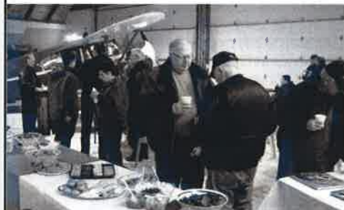
TechTalk break - animated conversation, a great spread of snacks and coffee, and an excellent selection of door prizes to be browsed (on the table on the right).