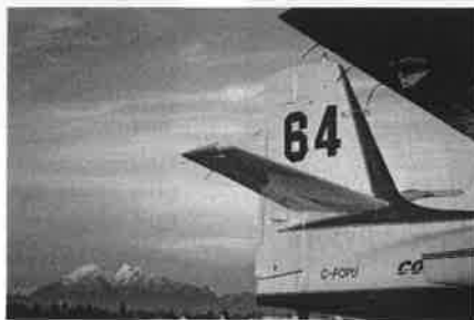
Conair Firecat Air Tanker #64, at home at Langley Airport.

Since the Museum acquired the Firecat, many people have asked why the Museum took it, and where it fits in with our plans. First of all, it started life as a Grumman CS-2F Tracker, which Conair modified in 1970 to be known as Firecat Tanker 64. This acquisition gives the Museum a great opportunity to